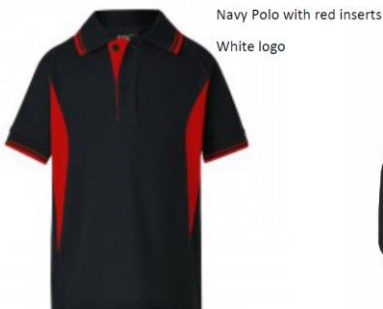
Navy Polo with red inserts White logo