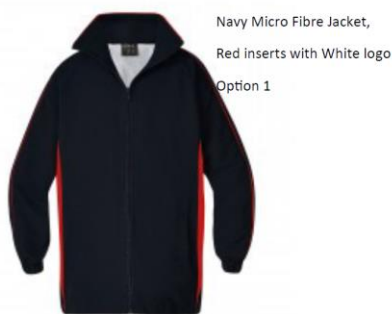
Navy Micro Fibre Jacket, Red inserts with White logo Option 1