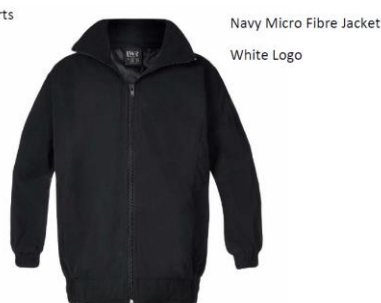
Navy Micro Fibre Jacket White Logo