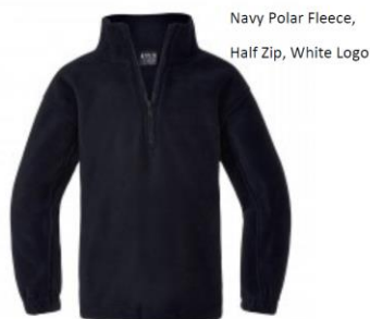
Navy Polar Fleece, Half Zip, White Logo

Feedback about the new design over the next month will be welcomed.